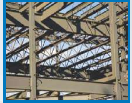
Mild Steel Structures