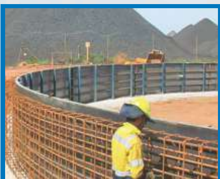
Civil Construction Work