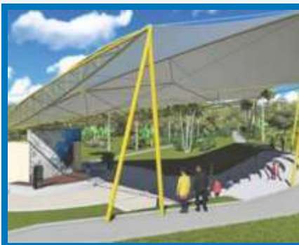
Tensile Fabric Structures