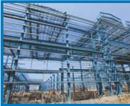
Metal Roof Structures