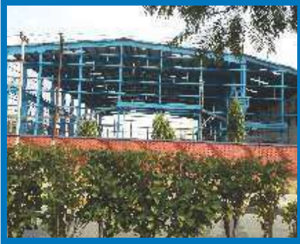
Pre Engineered Buildings