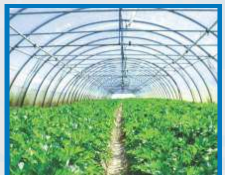
Green House Construction