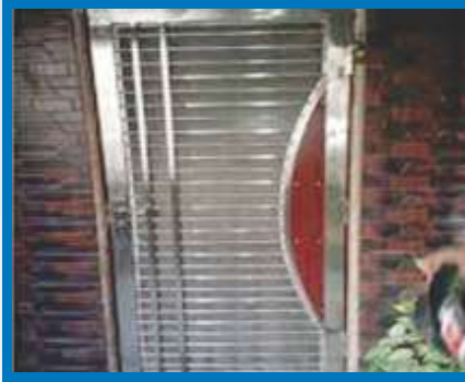
Stainless Steel Structures