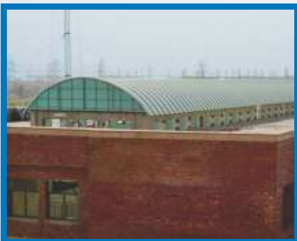
Polycarbonate Sheet Work