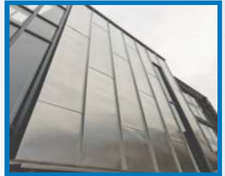
Stainless Steel Cladding